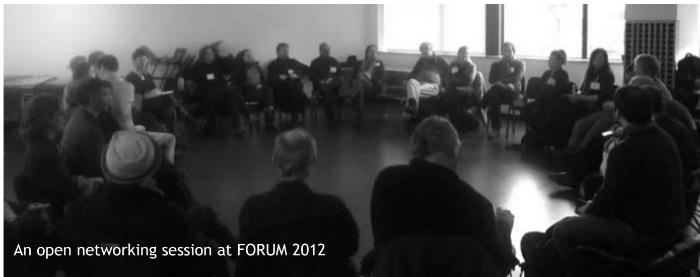
An open networking session at FORUM 2012