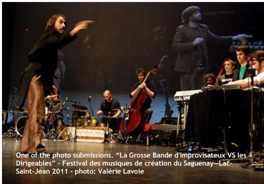
One of the photo submissions. "La Grosse Bande d'Improvisateurs VS les Dirigeables" - Festival des musiques de création du Saguenay-Lac-Saint-Jean 2011 - photo: Valérie Lavoie

If all goes according to plan, we will be adding video segments, but for now this call is for fixed images.